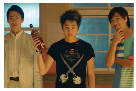
Preceded by the short film The Lovalist (2015), directed by Minii Kana