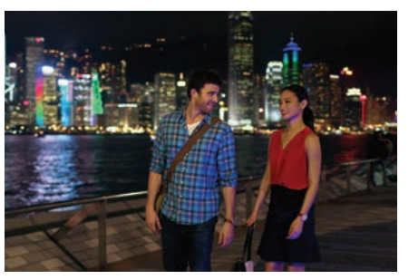
Preceded by the short film Hide & Seek (2015), directed and written by Kimie Tanaka